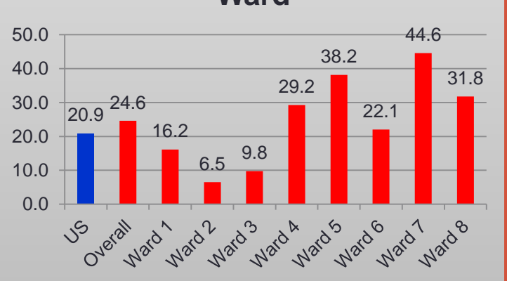
Figure 1. 2008 and 2009 average diabetes mortality rates by District Ward of residence; Source: DC DOH Vital Statistics...